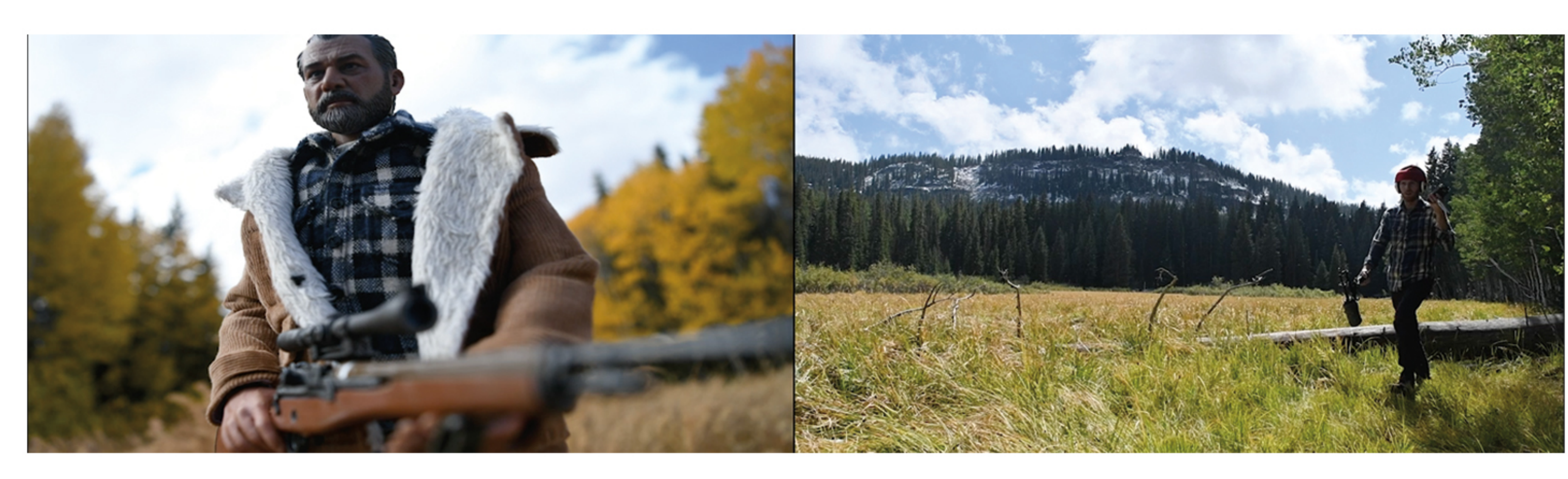
Sound Design 00:24