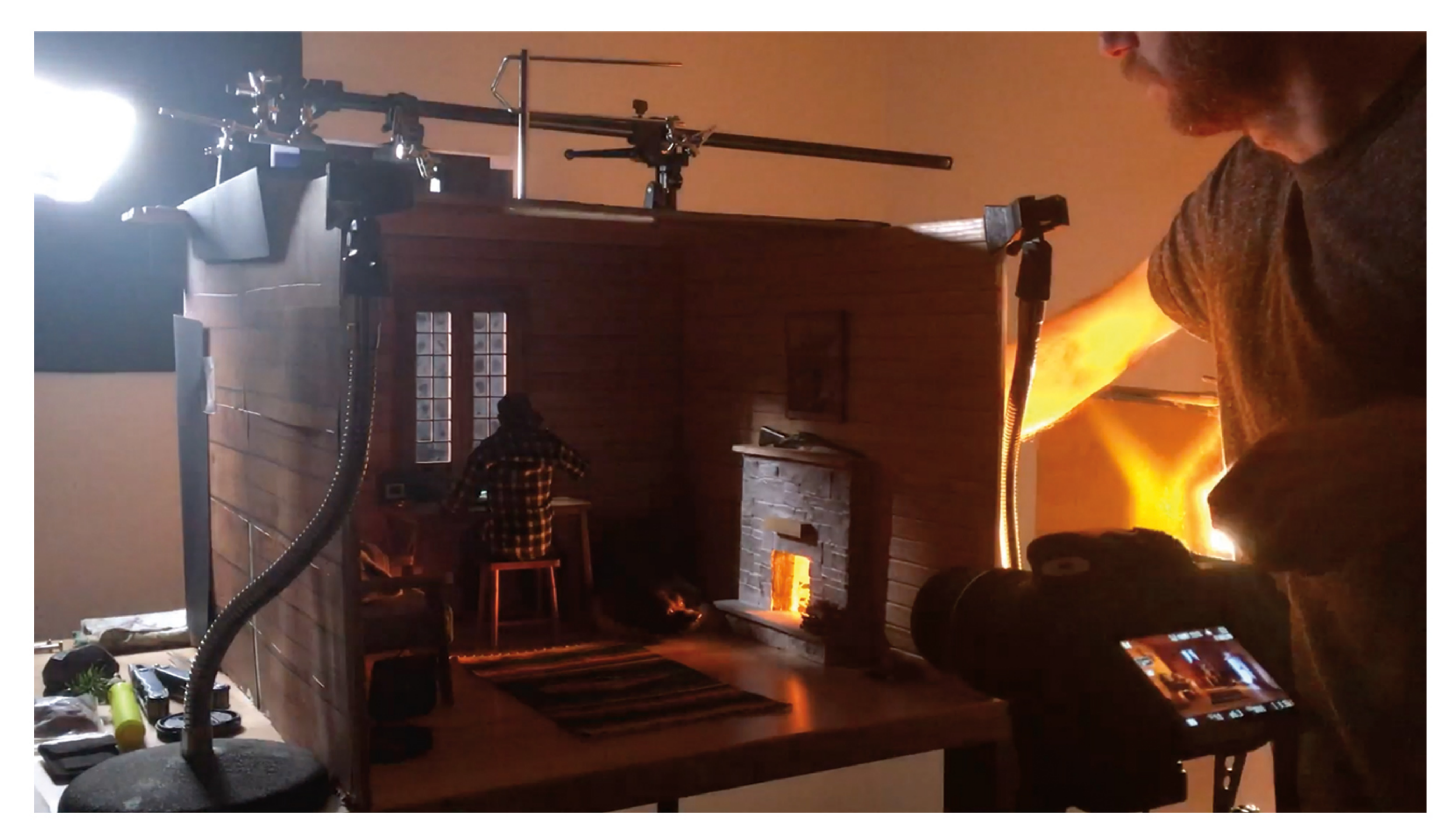
Cabin - Fire Light 00:40