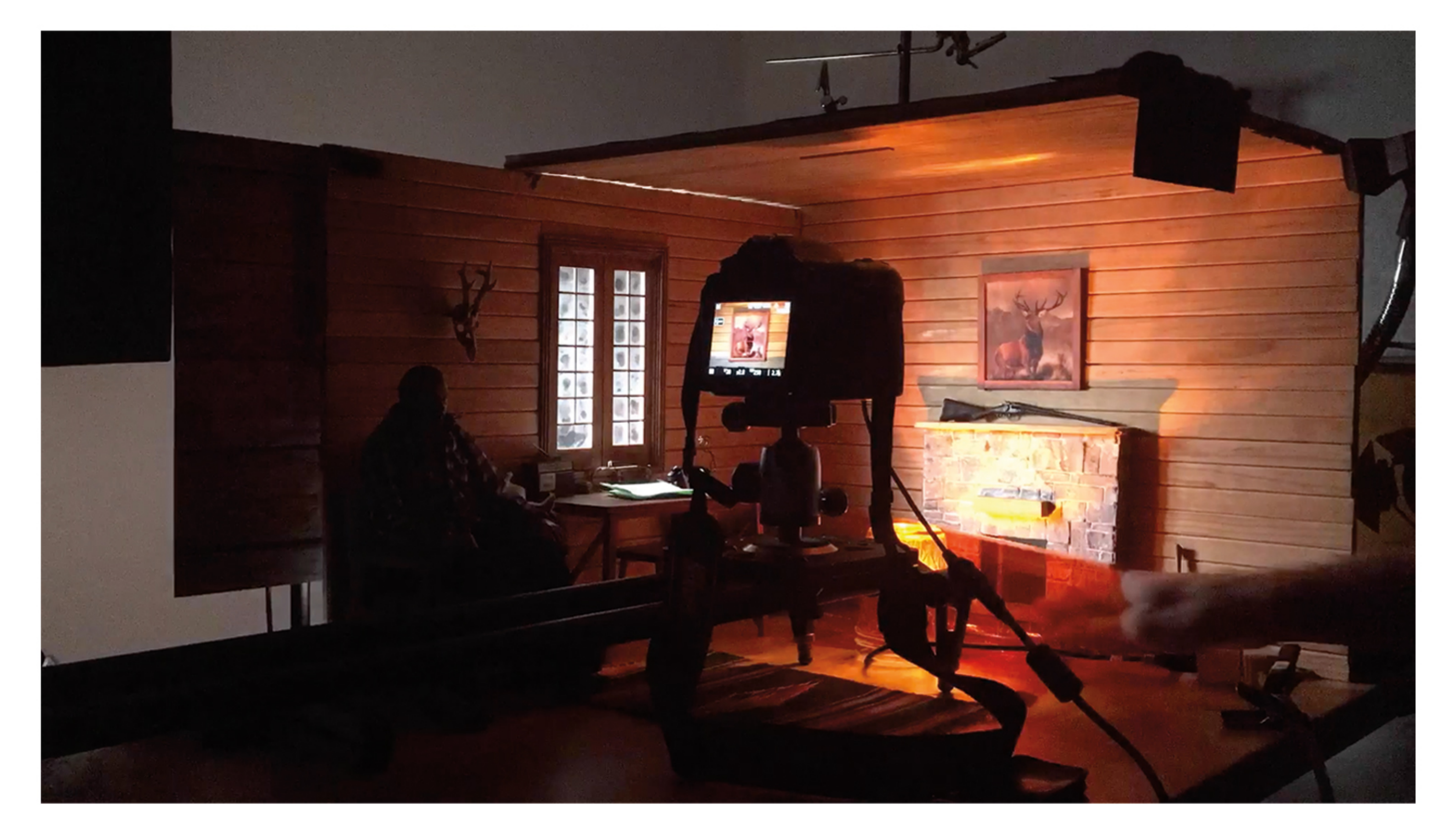
Cabin - Deer Painting